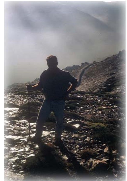
Herder in Andalusia