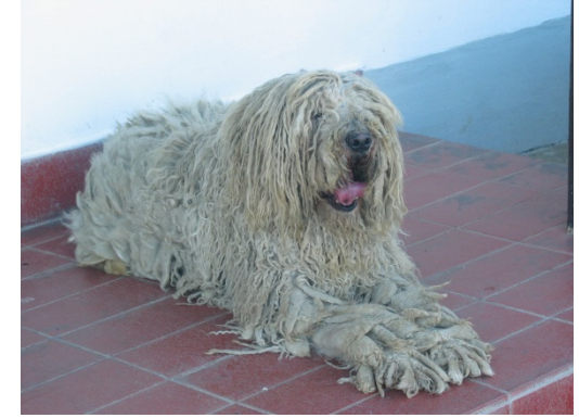
Typically for Hungarian Komondor is his snarled coat